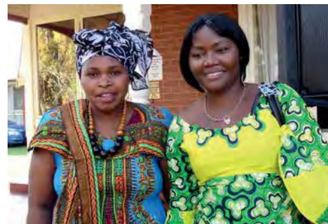
Dressed in their Sunday Best