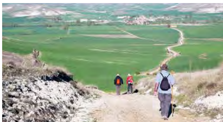
Left: Walking the Camino