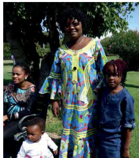
A typical family group at St Brendan's