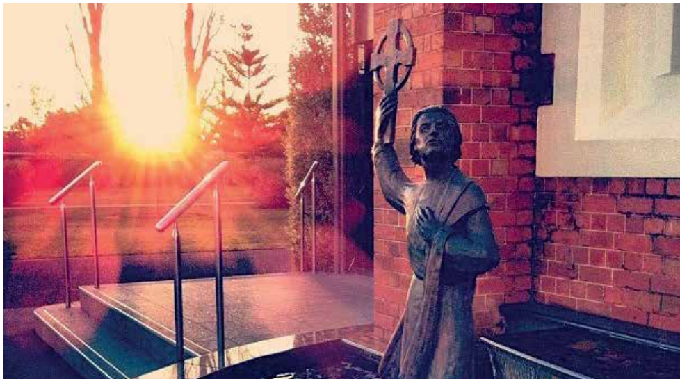
St Brendan's statue outside the church in Shepparton