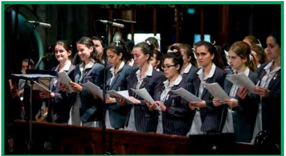
Student choir at the farewell Eucharist in St Patrick's Cathedral, December 2015