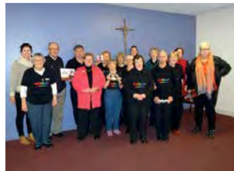
MacKillop Faith and Light Group, Shepparton