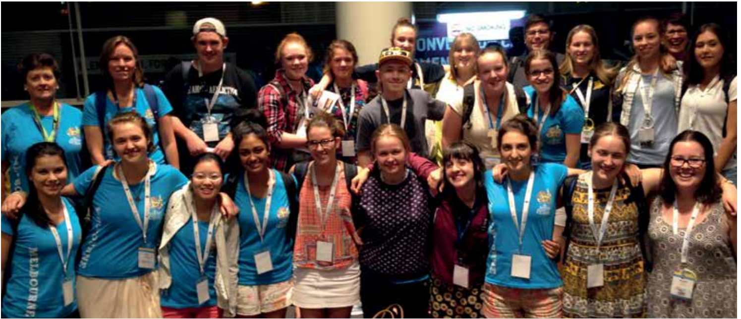
Genazzano and FCJ Benalla students

Last December, a small group of 10 students from FCJ College, Benalla, travelled to Adelaide to attend the Australian Catholic Youth Festival, as did a number of students from Genazzano FCJ College, Kew. This event was a celebration and gathering of over 3000 people aged from 15 to 25 and an opportunity to enhance and develop our faith as young people of the Catholic Church.