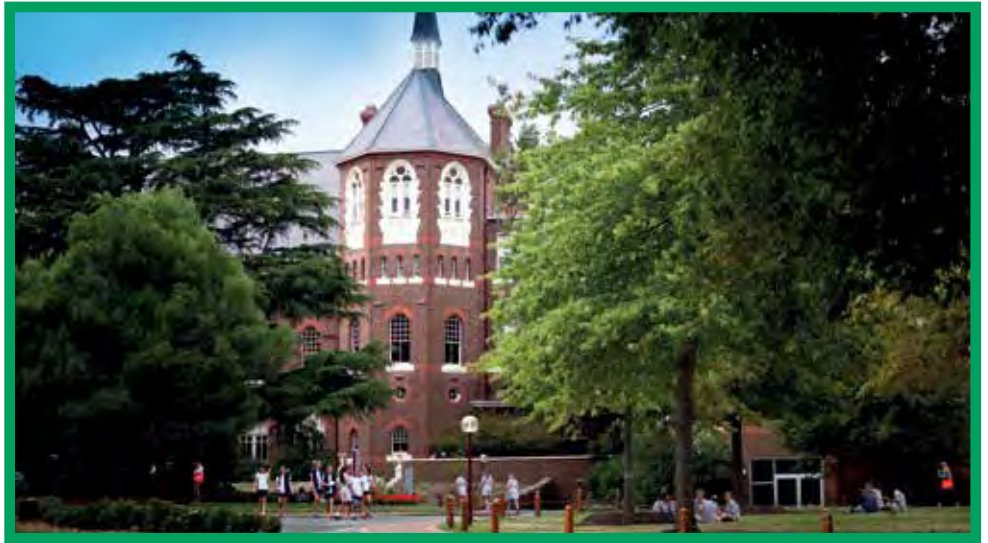
Genazzano FCJ College, Kew